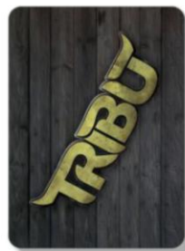
DECK OF CARDS

The Azione cards, if they are played, must be eliminated until the end of the successive challenge, putting them in another pile next to the discard deck, making in this way the deck of played cards from which the players cannot take anymore cards.