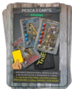
DECK OF PLAYED CARDS